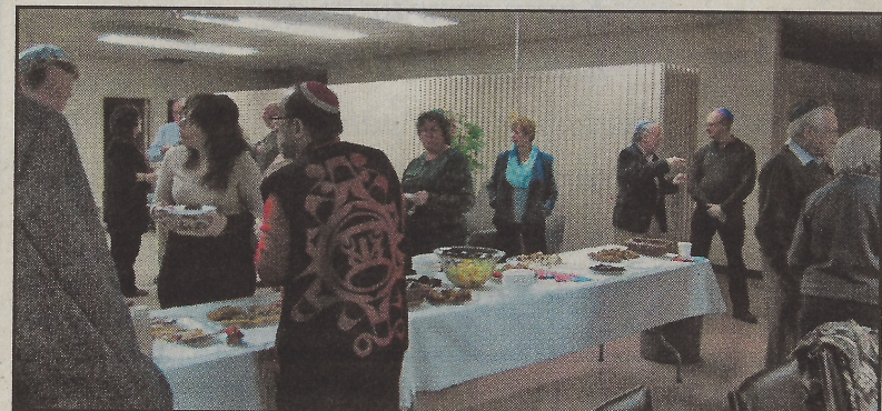
Refreshments were served after the program.